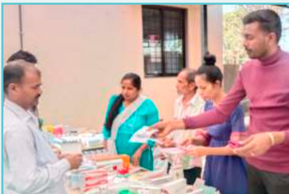
◀ Free Medical and Surgical camp at Subir, Dang district.