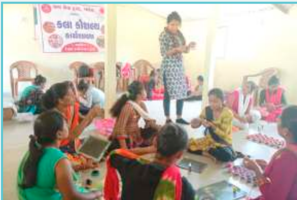
◀ Jewelry Making Training