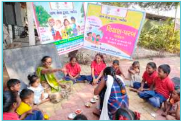
Learn with Fun at Tutorial Calss ▶