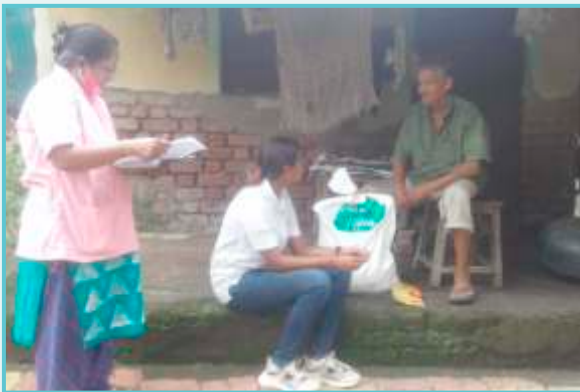
◄ Food kit distribution to the needy