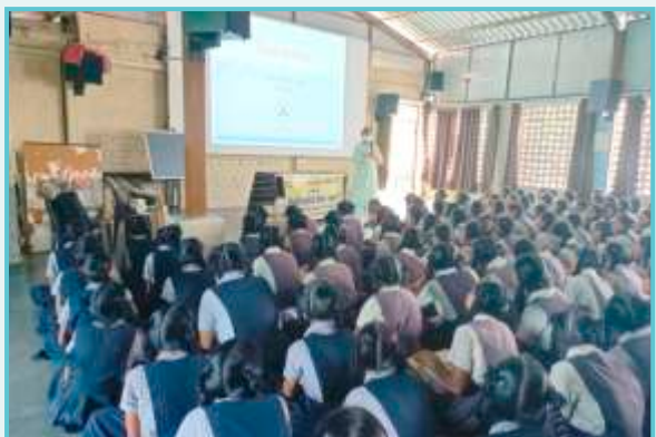
► Adolescent health education session