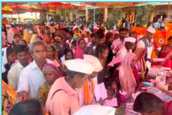
◄ Medical camp at Surgana