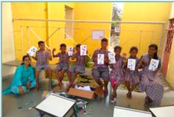
◀ Summer camp activities at "Parodh" Balawas