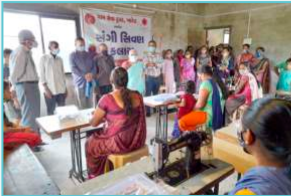
◀ Sangi Sewing Class