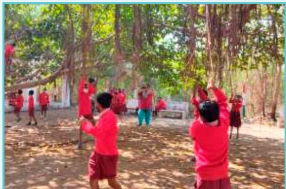
▶ "Parodh" Balawas picnic at Dandi