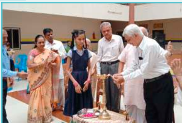
▶ Inauguration AAA+ Project, Dang