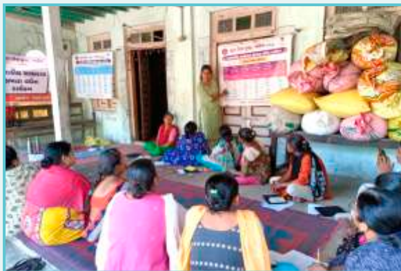
▶ Financial Literacy Training