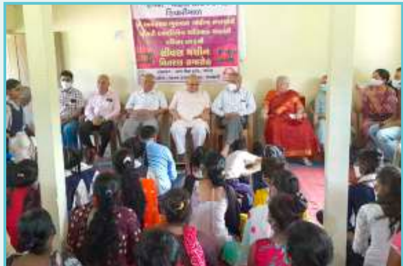
▶ Free Sewing Machine Distribution under Shabri Project, Dang district.