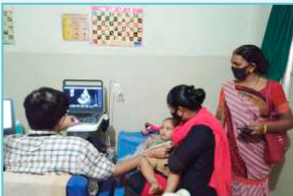
◀ 2D Echo Camp