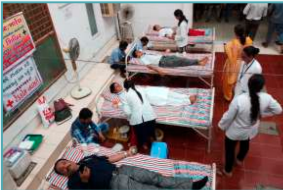
Blood Donation Camp at Kharel