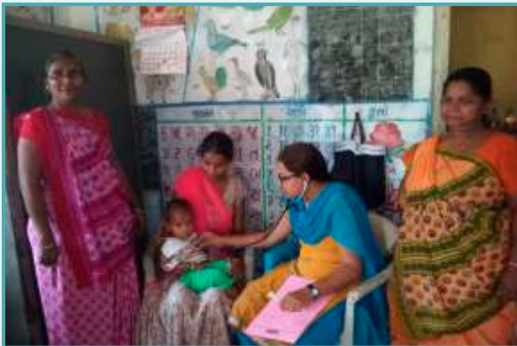
Checkup of Anganwadi Children