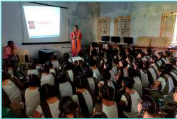
Workshop for Adolescents in Highschool