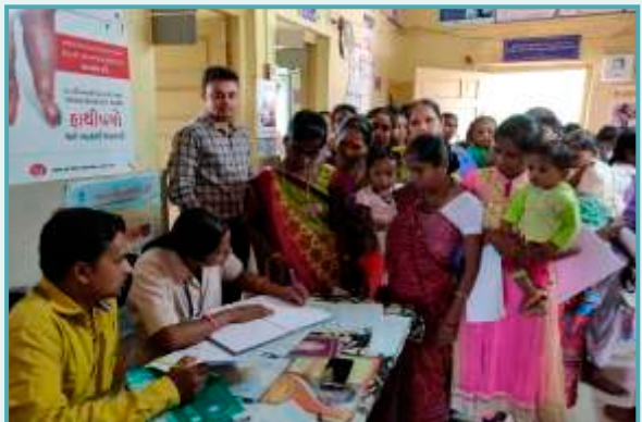
Women's Health Camp