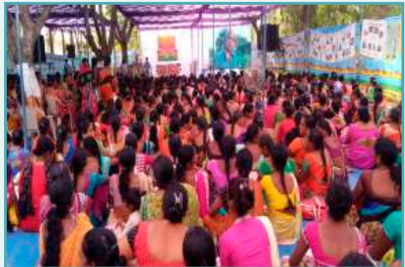
International Women's Day Celebration