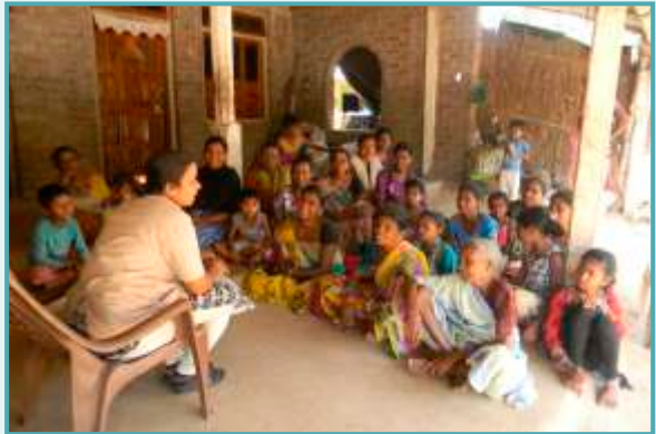
Meetings for Health Awareness