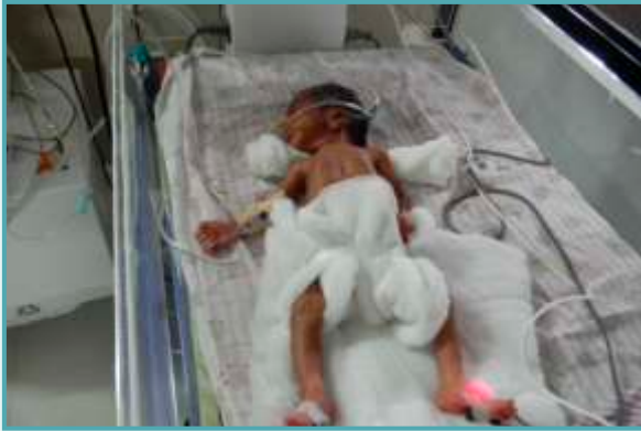
Newborn baby in NICU