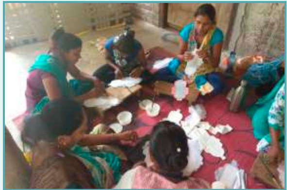
Training to make Sanitary Napkins