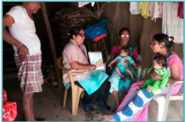
Home Visit in Child Health and Nutrition Project