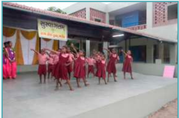
Annual Cultural Program by Parodh Balawas Children