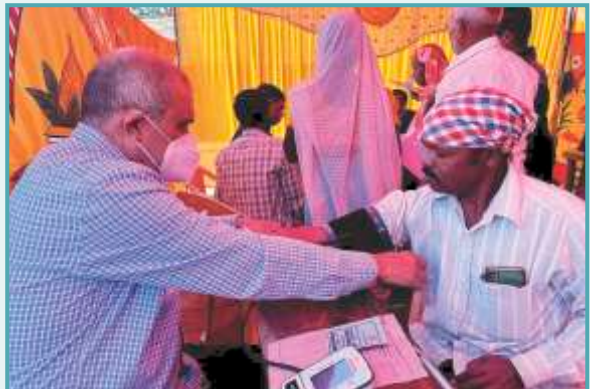
▶ Patient being checked up at General Camp