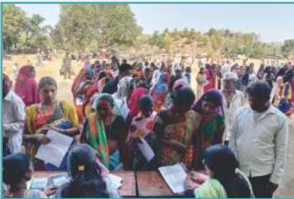
▶ Mega General Medical Camp, Surgana