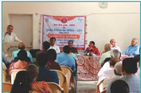
▶ Inauguration of Project 'AANGAN' and Women's Training Projects