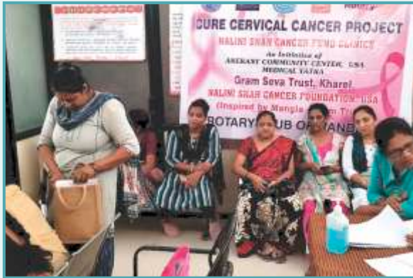
◀ Cervical Cancer Clinic