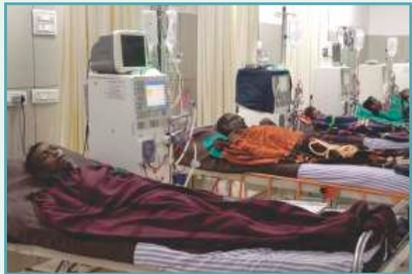
▶ Dialysis Ward