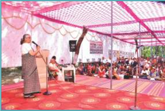
◀ Celebration of International Women's day