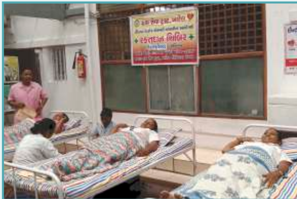
◀ Hospital Staff Participating in Blood Donation Camp