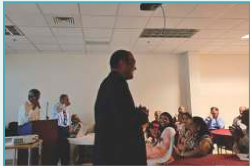
Fund Raising Program Chicago and Boston, U.S.A.