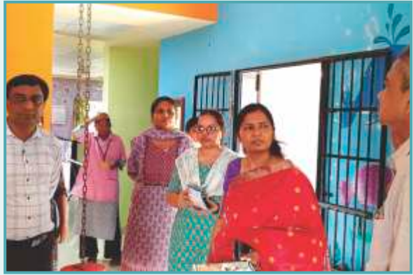
▶ Visit by District Development Office, Navsari