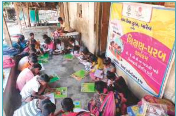
Shikshan Parab Program at Village