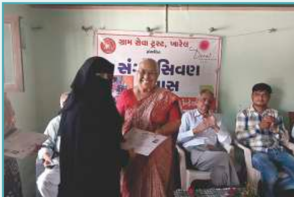
Sangi Sewing Class Certificate distribution