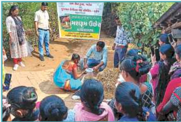
Mushroom Cultivation Training