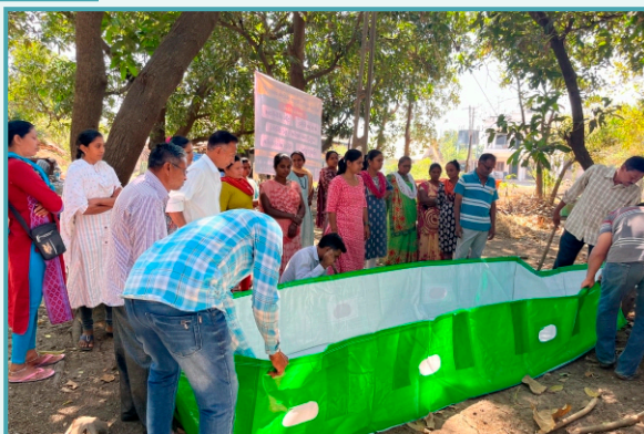
▶ Vermi Compost Training