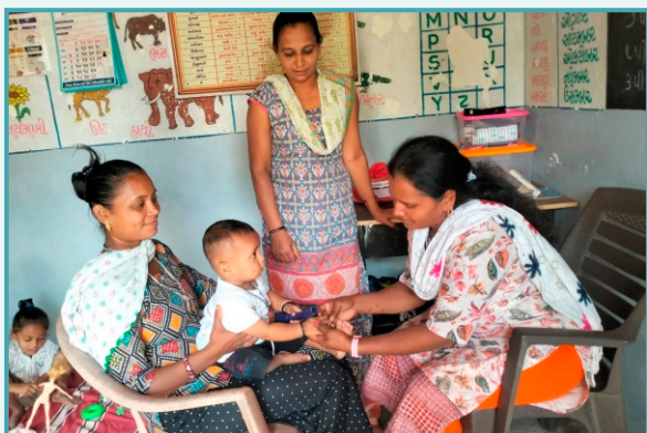
◀ Home visit under "Aangan" Project