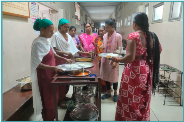
► Free Meal to the patient admitted in the Hospital