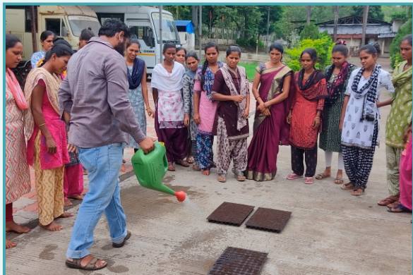
◀ Mushroom Cultivation Training