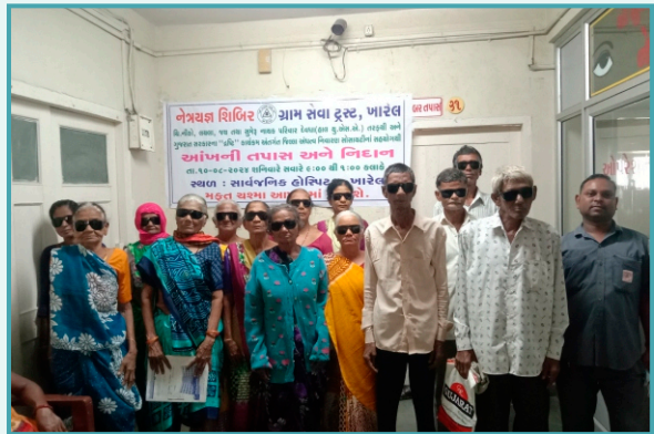
▶ Eye Camp