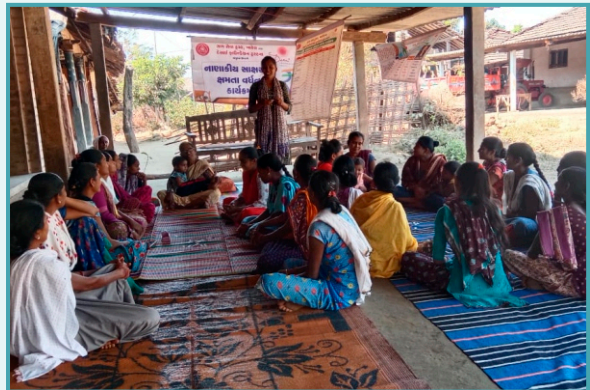
► Financial Literacy and Skill Development Project