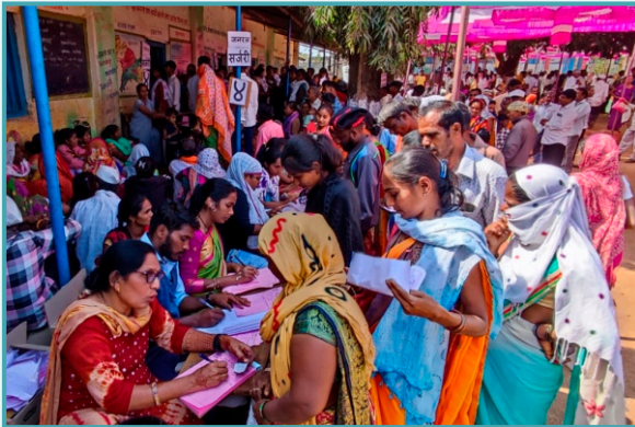
◀ Mega Medical Camp in interior area of Dang.