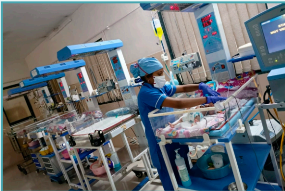
◀ NICU Ward