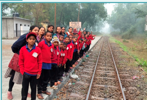
▶ Picnic of "Parodh" Balawas Children