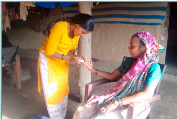
◀ Follow up of a Diabetes Patient