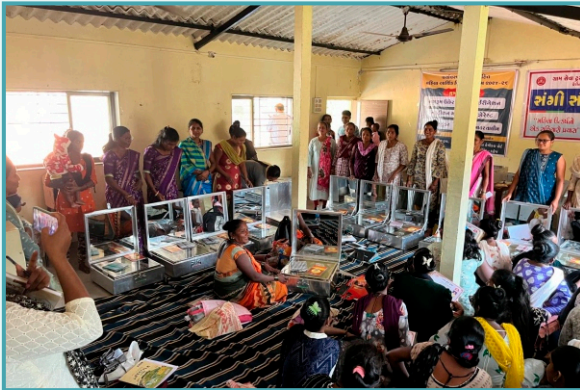
◄ Solar Cooker distribution