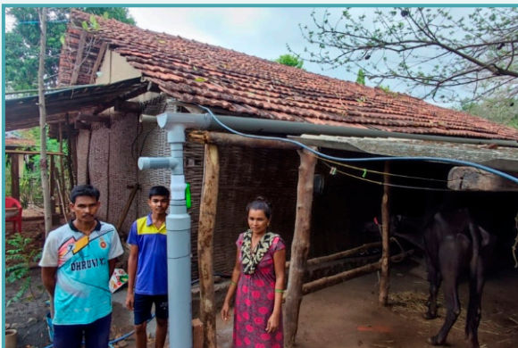
◄ Rain Water Harvesting