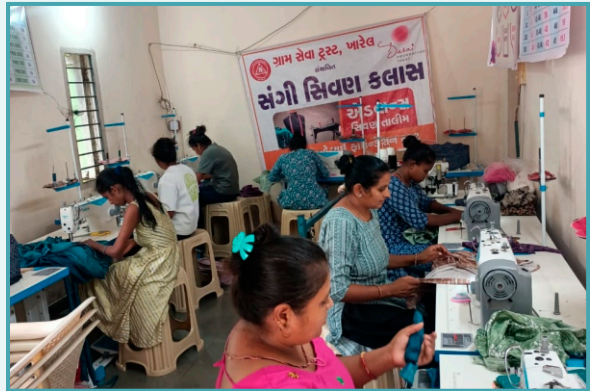
► "Sangee" Sewing Class